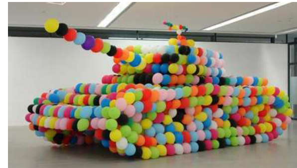
Bundle of IP